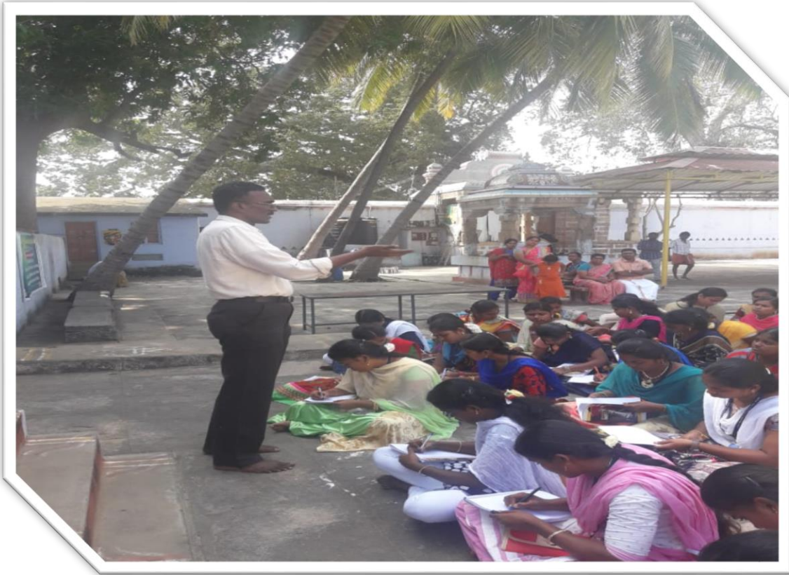
Session III : Field Study : Arulmigu Arjuneswarar Temple, Kadathur, Madathukulam Taluk, Tirupur District Topic : Components of Temple Architecture